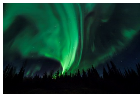
Northern Lights in the Peace River Regional District

The Regional Board approved a grant in the amount of $15,000 for the Peace Liard Regional Arts Council for 2016 from the Regional Recreation Function to provide support of their ongoing regional operations and projects associated with the 75th Anniversary of the Alaska Highway.