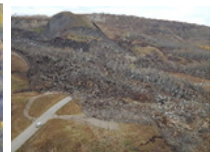
October 6, 2018