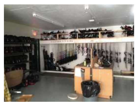
Equipment rentals building

Building type: Pre-manufactured portables. Operator's booth and electrical are small permanent buildings.