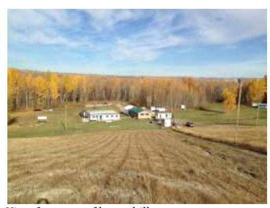
View from top of lower hill

Square footage: Site area unknown, buildings combined area approximately 4.500 SF.