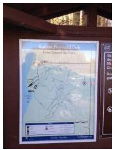
Trail routes signage

Building type: Staff building wood frame.