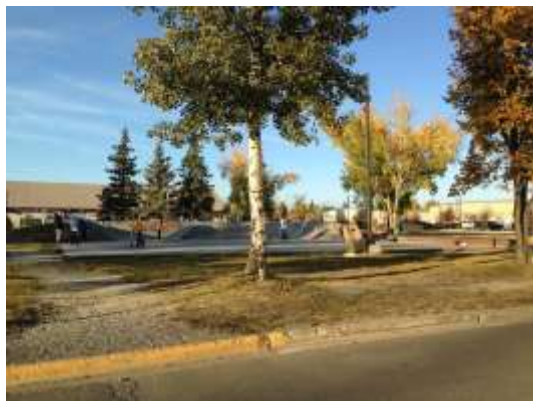
Skatepark from road

Description: Novice to intermediate skateboarding park.