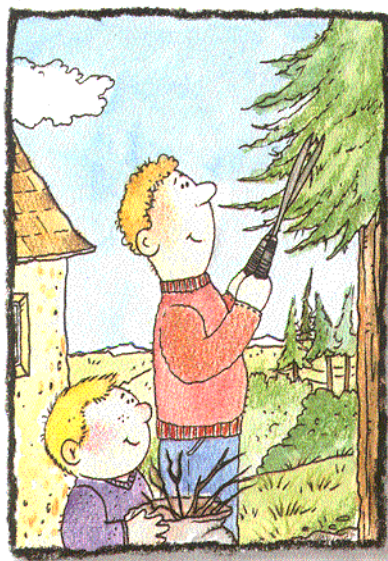
Prune trees regularly